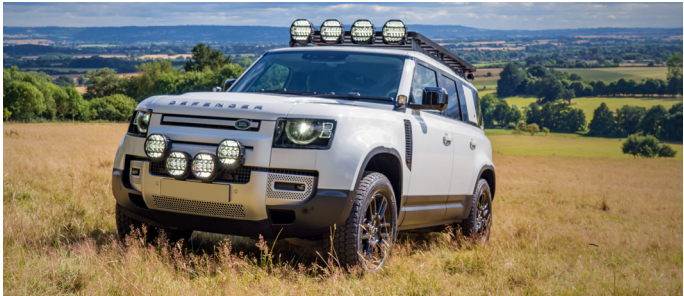
VEHICLE MOUNTING KITS