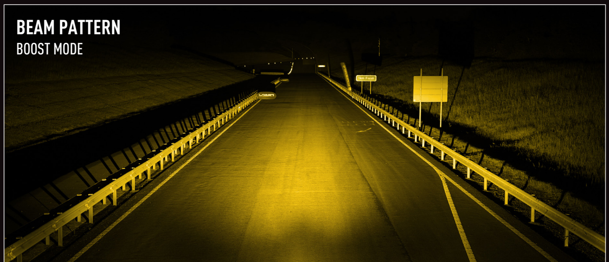
BEAM PATTERN BOOST MODE